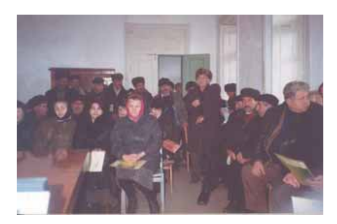
Qusarchay community member expresses his believe in participation which is an important factor in effective utilizing of community resources.

• Information on health: One of the keys to improved health care status is an educated public. In spite of the fact that the health education materials were distributed to health centers in the districts, these materials are only kept or hanged on the walls of health centers or hospitals. In addition, health workers do not take active part or involved in dissemination of health education materials while delivering health services.