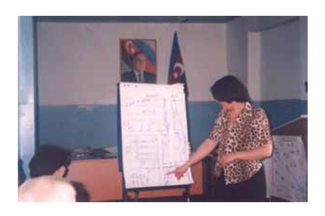
Khudat CHC member analysis the community map paying attention to social – economical opportunities in community.

Communication techniques are as follows: festivals, parties, newsletters, news releases, special events, public meetings, establishing neighborhood information brokers, and establishing networks with resource people.