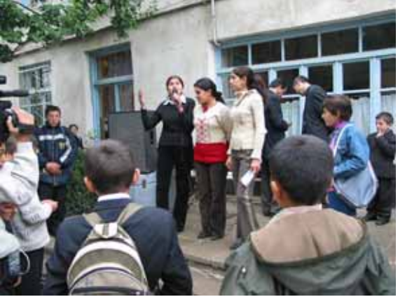
Health Fair was open for all community members, especially for vulnerable people to be examined for free in Qarabagly community