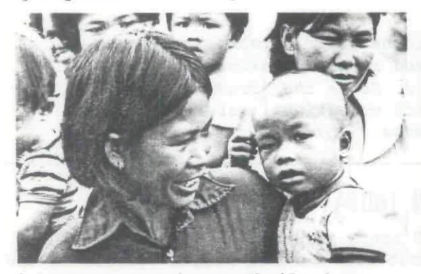
(above) In Northeast Thailand today, 80-90% of the babies are still brought into the world by traditional midwives.