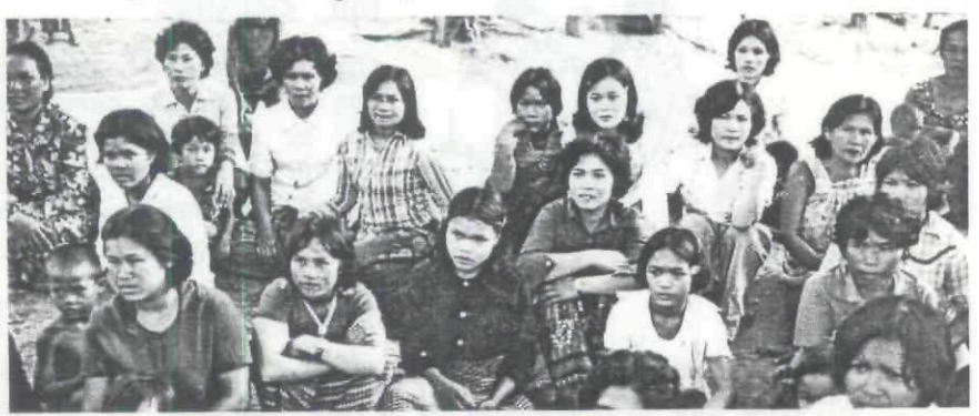
(above) The ratio of doctors to Thailand's rural population is about 1 to 84,000. With one million new births each year, Thailand's 45 million population is increasing rapidly, and the country's four medical colleges can produce only 350-400 new doctors annually.