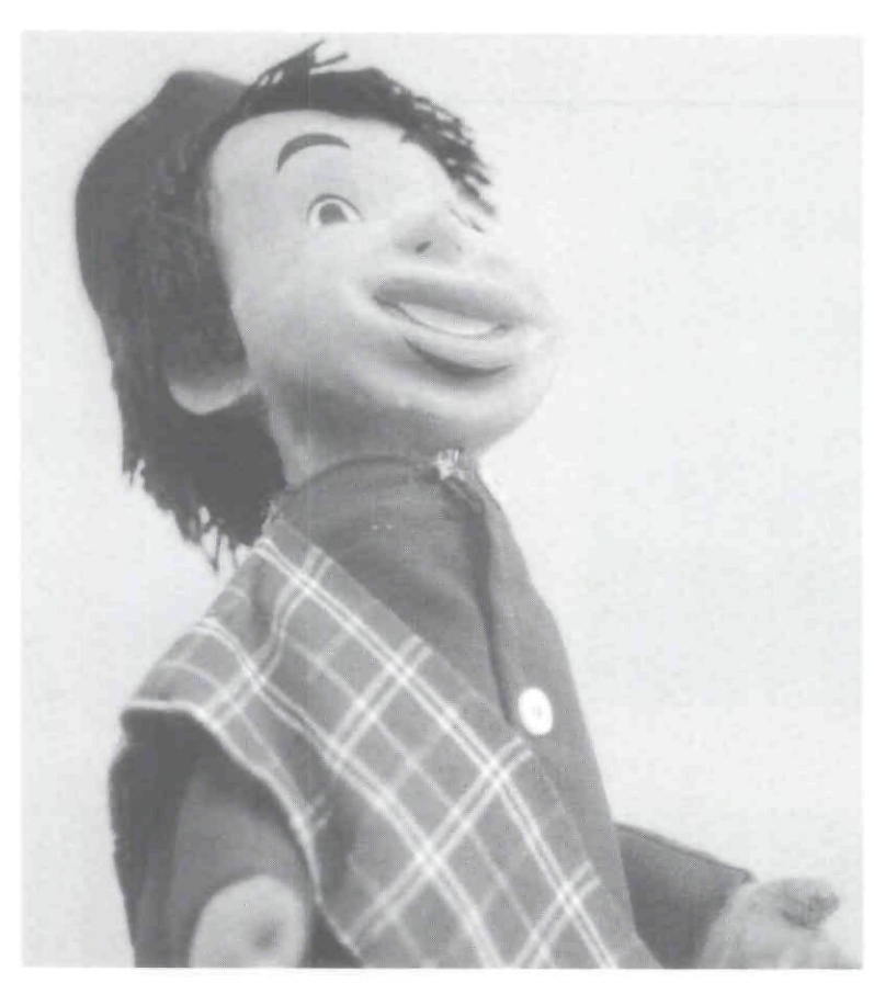
"Si Unyil," a puppet-based television programme in Indonesia used to educate children on hygiene and health practices.