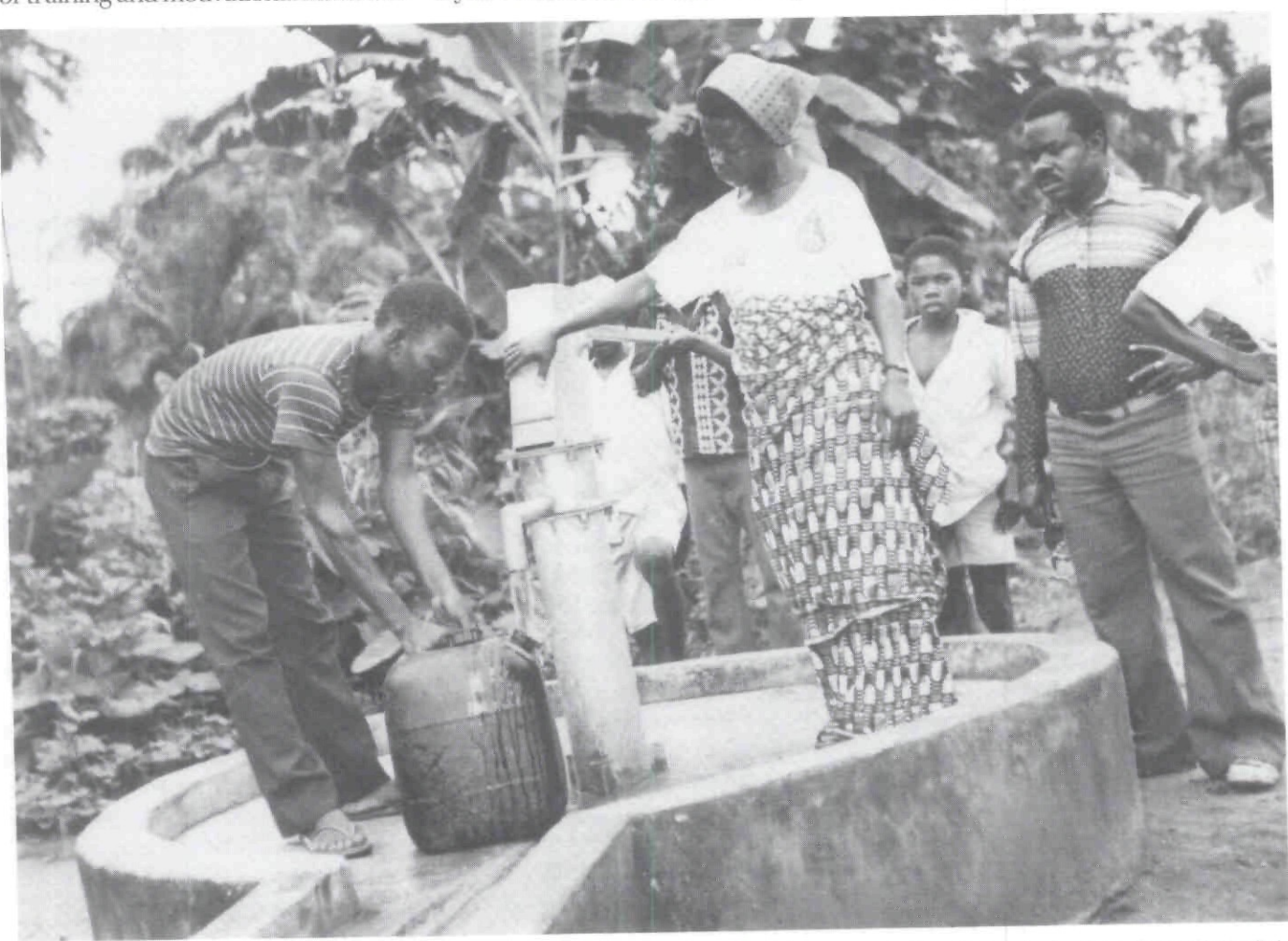
Imo State Rural Water Supply and Sanitation Pilot Project in Nigeria. A community-based integrated rural development pilot project, linking drinking water supply, sanitation, health education/training of Village-