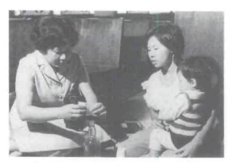
In Rajburi Province, Thailand, a health worker shows a local mother how to mix the contents of an oral rehydration salts (ORS) packet with water.