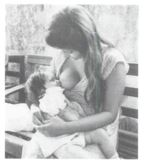
A young mother breastfeeds her child at a health centre in Guayaquil, Ecuador. Mother's milk is the best and safest for babies everywhere.