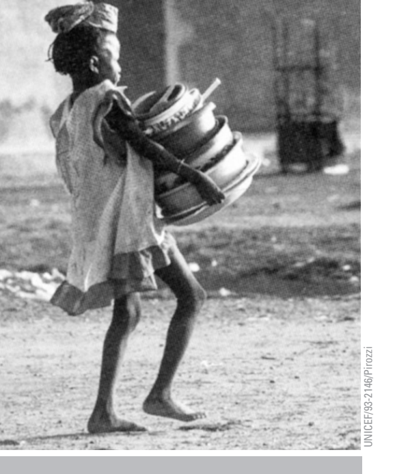
Child labor is often an accepted means for childcare.