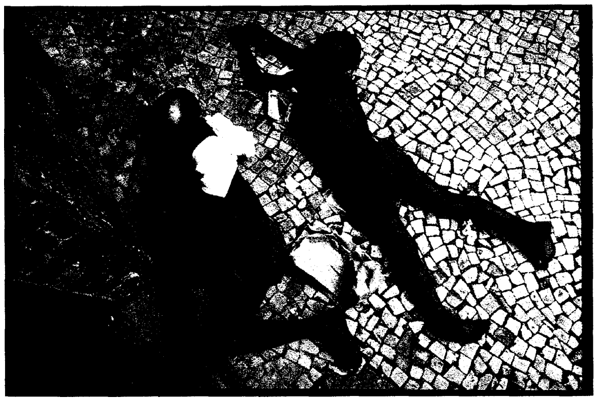
Brazil/ Horner, 92-122 UNICEF

context within which children are exploited. An additional number of 150-200 million children in this age group do unpaid domestic work, many of them girls.